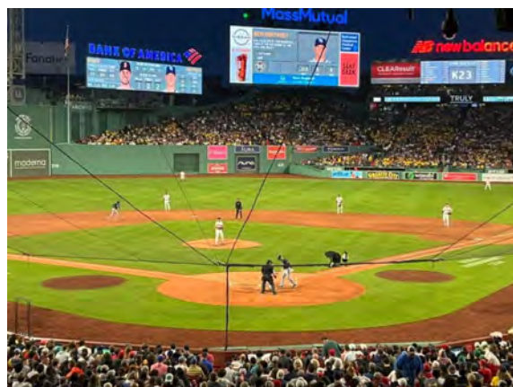
The view from our seats!