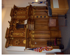
Our historic ark

Congregation Beth Israel was established in 2004, by combining two Merrimack Valley congregations, each with a long and interesting history. Temple Beth El, of Lowell, and Congregation Tifereth Israel, of Andover, were both hundred-year-old synagogues with a wealth of pride, experience and tradition. The logo of CBI represents, in its central element, both the Eternal Flame of Judaism and the Merrimack River which physically connects the two historic congregations.